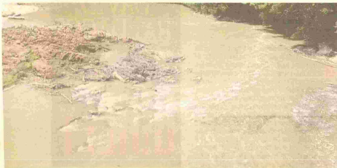
Muddy waters and a lack of trees at the riverbank at Ulu Tembeling.

We need to see, touch and feel our trees before we lose them completely, writes Aneeta S