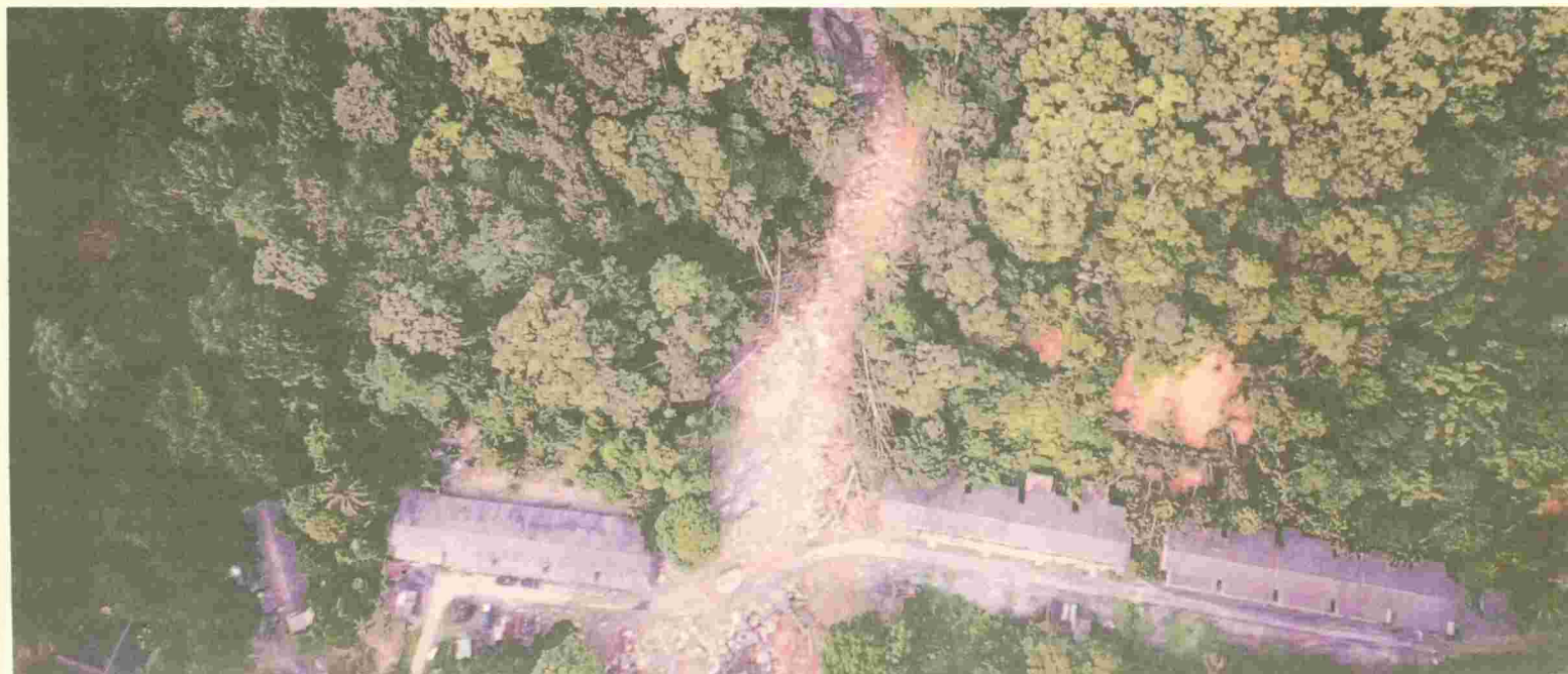
Quarters of the Forestry Department destroyed after heavy rains and mudslides.

"We must have hope. Pick the silver lining and work with it," says the 46-year-old passionate conservationist. The "silver lining" he speaks of is in part the fact that